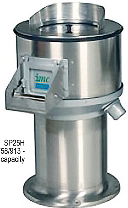
SP25H Model F58/913 - 600Kg/Hr capacity