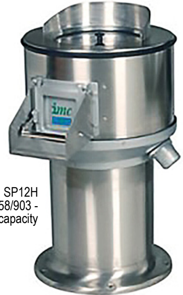
SP12H Model F58/903 - 300Kg/Hr capacity

With a choice of pedestal heights to fit a tank or catering sink, a flexible hose or plumbed-in waste outlet on either side and the option of an integrated filter basket, an SP Peeler fits easily into your working environment.