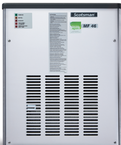
Nugget ice 1g – Ø11mm x H 13mm

MFN S 46 AS OX Nugget ice – 1g – Ø11mm x H 13mm