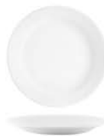
ROUND PLATE NARROW RIM

Item Code 902607 Diameter 180mm Height 23mm