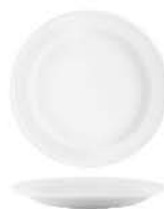
ROUND PLATE ROLLED EDGE

Item Code 904208 Diameter 205mm Height 25mm