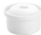
CASSEROLE DISH WITH COVER