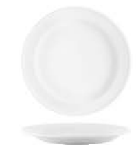
ROUND PLATE ROLLED EDGE

Item Code 904209 Diameter 232mm Height 28mm